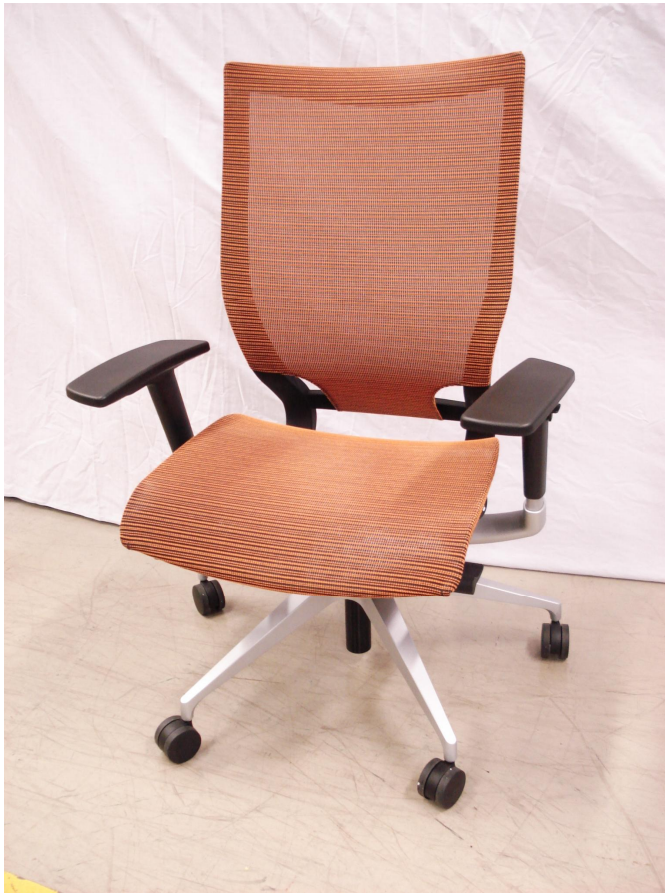
Photograph 1 : Freniq Mesh Chair