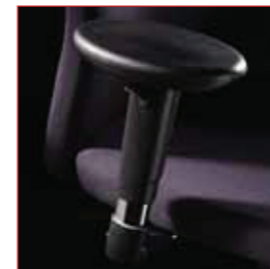
'A12' height adjustable armrest