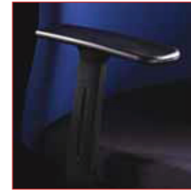
'EA1' fixed armrest