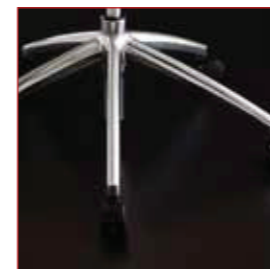
Aluminium die-cast base