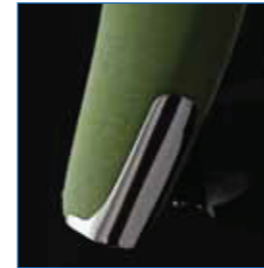
L-shaped design capping