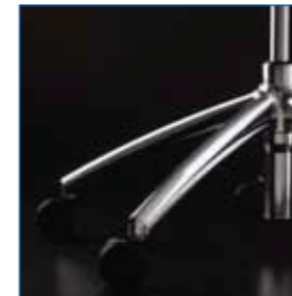
Aluminium die-cast base on castor