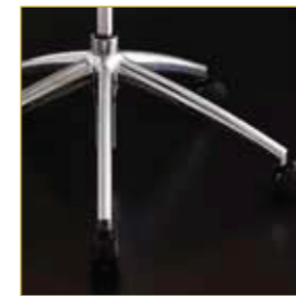
Aluminium die-cast base