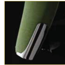
L-shaped design capping