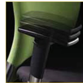
'A10' height adjustable armrest with PU padding