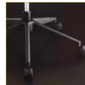
High-legged nylon base